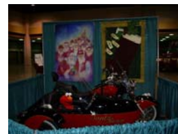
Santa-America Motorcycle and sidecar